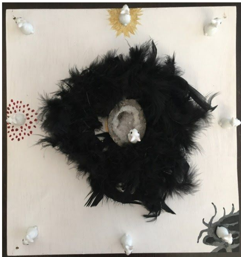
Joy Redstone's mixed-media piece for The Boulder Bunny Rabbit Art Challenge features a geode in the center.

Redstone, who often crafts pieces from found objects, views creating art as a powerful healing process.